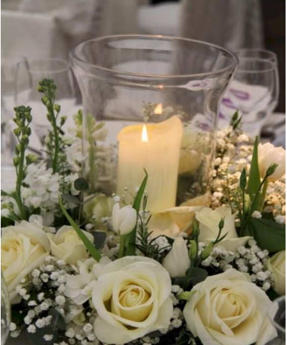
Tall Centrepiece 80€