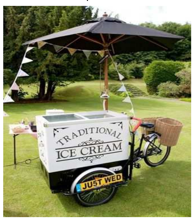
Ice Cream Cart for 50 pax with 4 flavors 250 euros