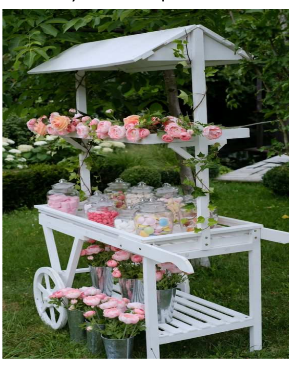
Candy Bar Cart for 50 pax 250 euros