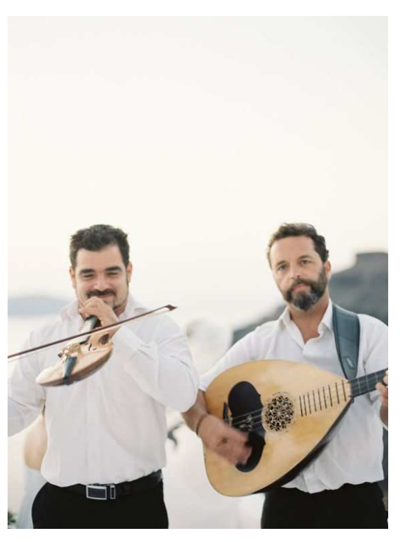
Bridal Band 210€