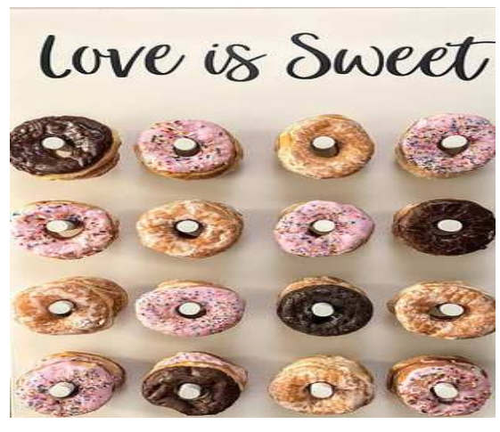
Donut Wall for 50 pax 120 euros