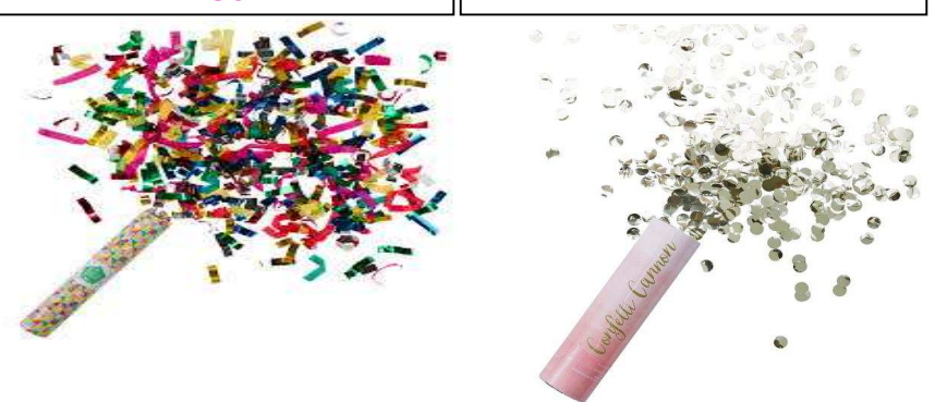
Colorful simple Confetti Bomb 12€