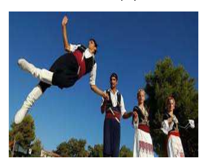
Oriental Fire Show 340€ (1Hour)

Greek Band with Dancers (1 hour):495 € Greek Band (1 hour) 380 € Greek Dancers with Cd player 240€